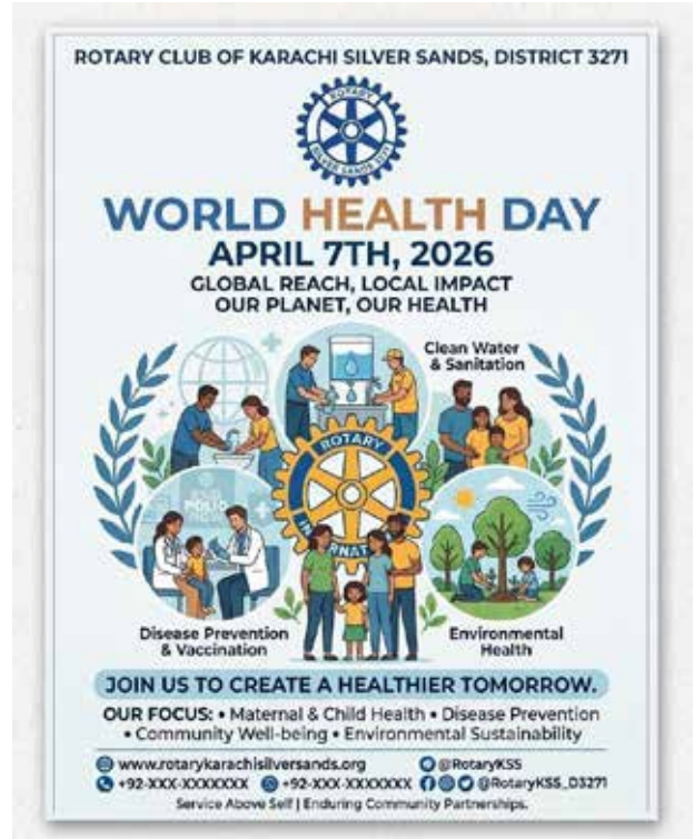
World Health Day celebration by Rotary Club of Karachi Silver Sands