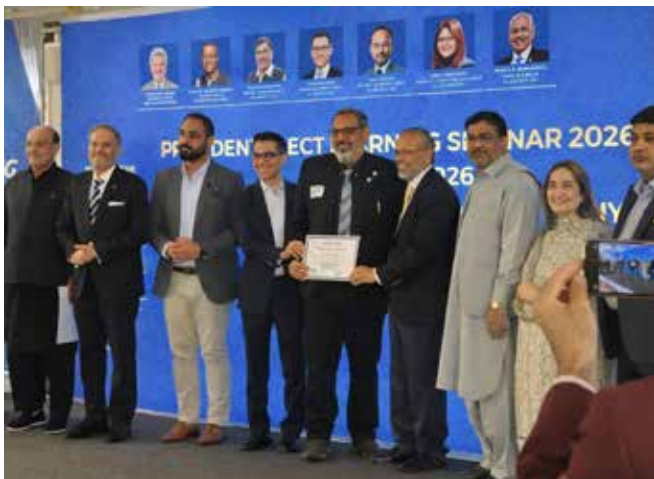
Presidents Elect Learning Seminar organized by District 3271