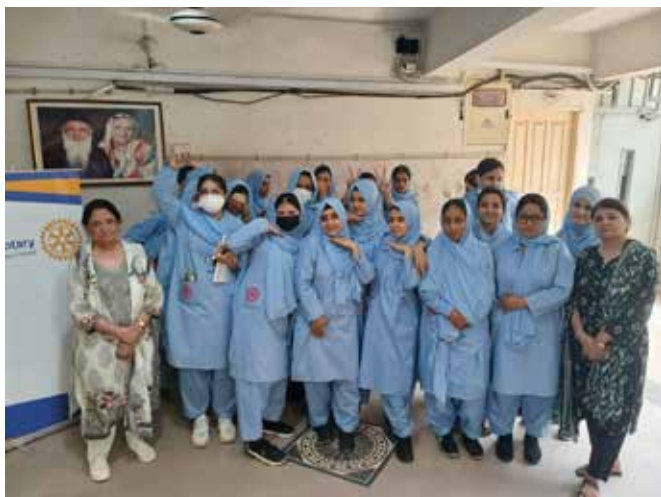
RCKNC, conducted a session on - Gestational Diabetes for 30 midwifery students and one faculty member at Bilqis Edhi CMW School, Lyari