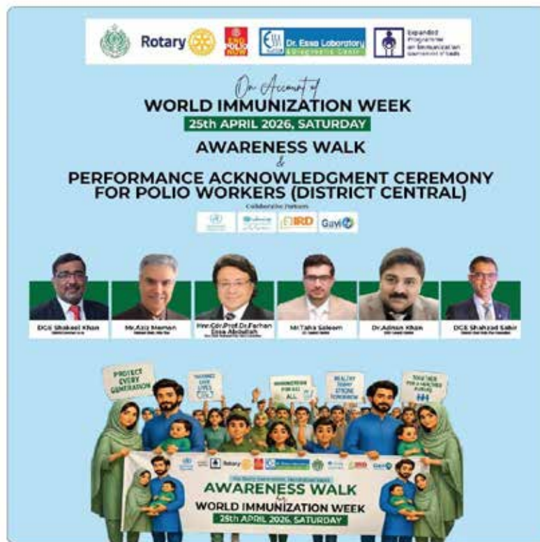
District 3271 organized an Awareness Walk on April 25 to celebrate World Immunization Week