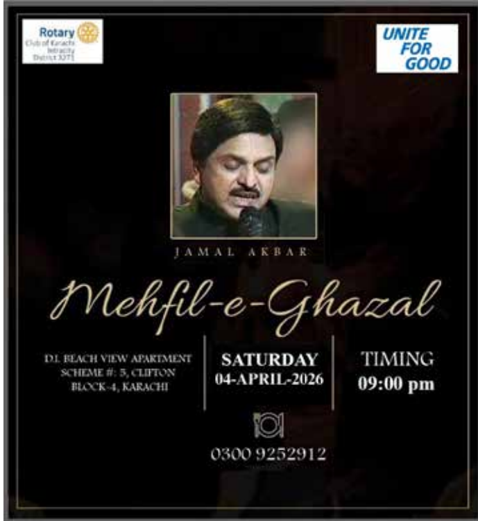
Mehfil e Ghazal of Rotary Club of Karachi Intracity