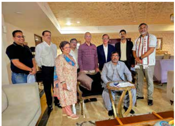
Visit of DG District 3271 to Rotary Club of Karachi Creek